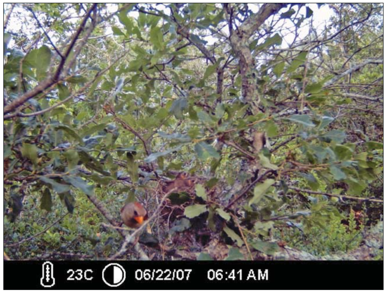
Figure 8. The diversity and productivity of non-game species can be monitored and documented with the use of trail cameras. A female northern cardinal (Cardinalis cardinalis) visits her nestlings.

this valuable information can supplement annual population and browse-survey data to help adjust management practices and harvest quotas.