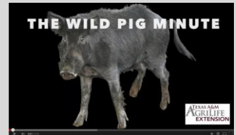
Educational video series