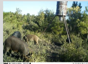
Pre-baiting feral hogs