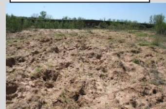
Feral hog rooting damage