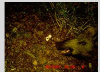
Feral Hog Consuming Rio Grande Wild Turkey Nest