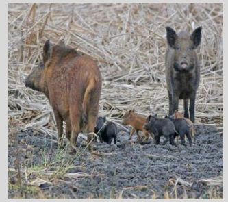
Feral hog sounder