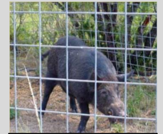
Trapped feral hog