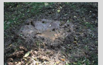
Feral hog wallow