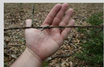
Hog hair on fence