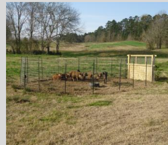
Corral trap with feral hogs