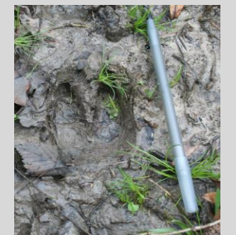
Feral hog track