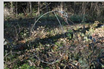
Feral hog snare