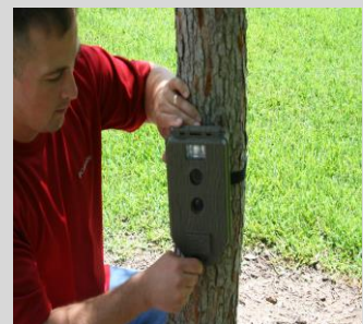
Trail camera installation